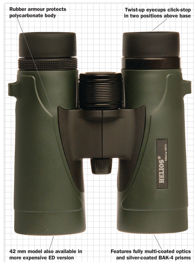
42 mm model also available in more expensive ED version

image reaches a surprising level of quality. The field of view is generous, chromatic aberration is pegged at a relatively low degree